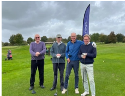
Happy golfers at the 2023 Golf Day