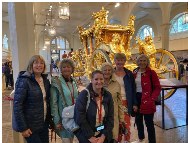
ARDA volunteers enjoying a day out at the Royal Mews, July 2023