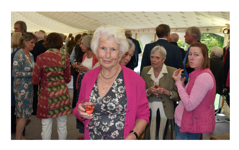
Sarah masterminded the catering with Penny Wood at the party in May.