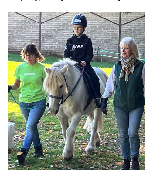
A rider and volunteers from Wolverdene at the Binley Ride